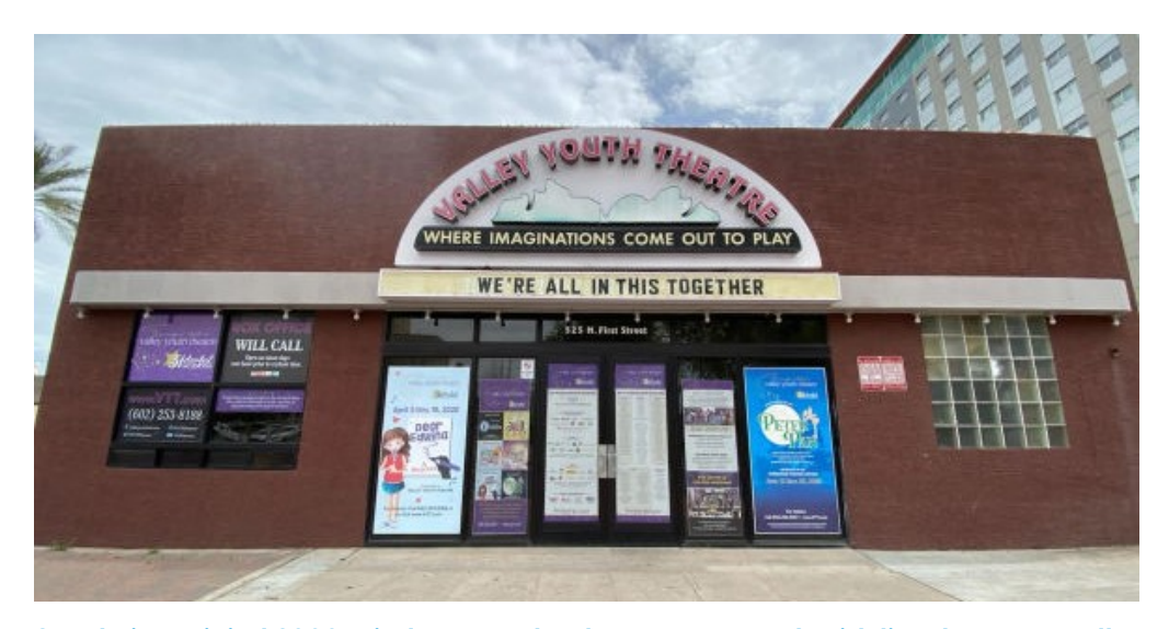
Sennheiser Digital 6000 Wireless seamlessly connects youth with live theater at Valley Youth Theatre

Professional grade youth theater meets professional grade digital wireless after upgrade